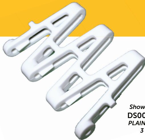
Shown above: DS0011P-3V PLAIN CENTER 3 LINK

50mm SuperTight chain has one of the lowest turning radii in the industry meaning you can cut corners in your layout. Its open rod design allows for good air flow to your product, which is perfect for cooling or drying applications. This chain is available in all the same widths as our MultiSpan chain and 25mm Supertight chain.