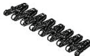
DS0011P-7M - PLAIN CENTER